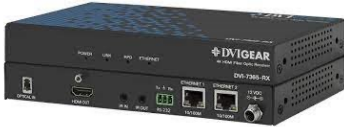
DVI Gear (Transmitter, Receiver & Repeater) @ ₺1,710,000