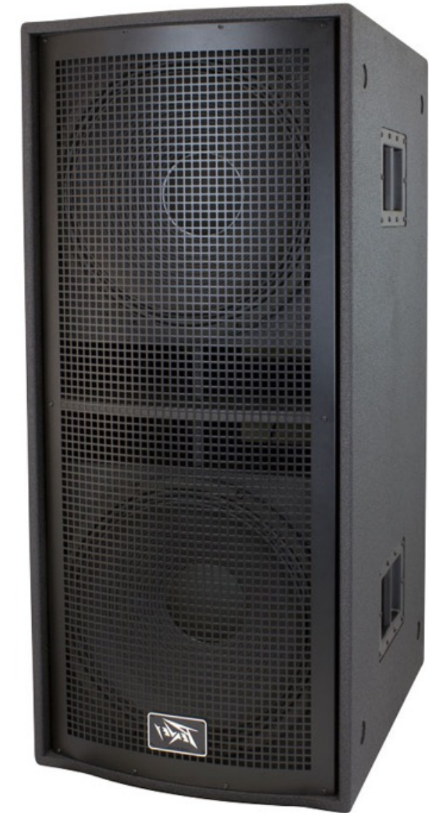
4 units of QA 218 Subs @ ₺1,300,000 each Total: ₺5,200,000