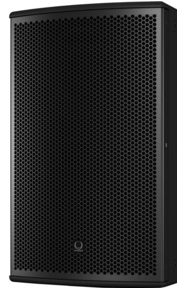
4 units of 10" Full Range Speakers @ ₺180,000 each Total: ₺720,000