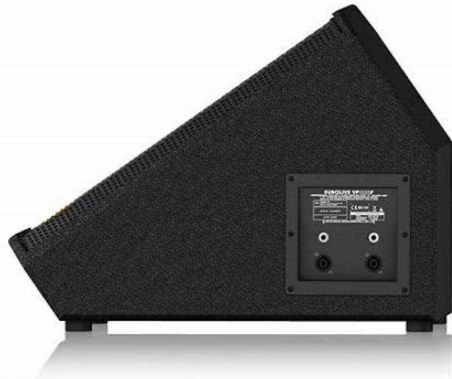
2 Floor Monitors @ ₺950,000 each Total: ₺1,900,000