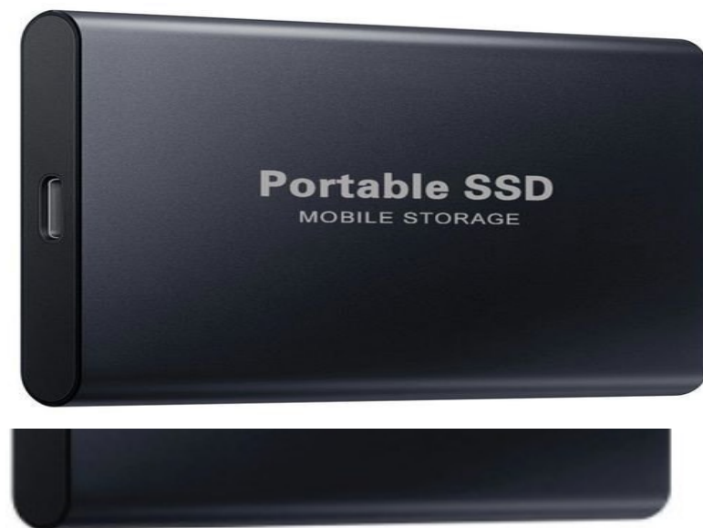
4TB SSD EXT Drive @ #100,000