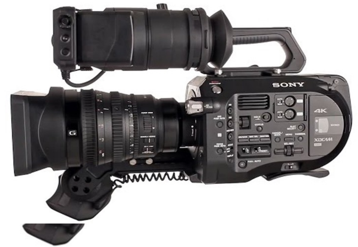
5 Sony PXW-FX7 XDCAM 4K @ ₺6,825,299 each Total: ₺34,126,495