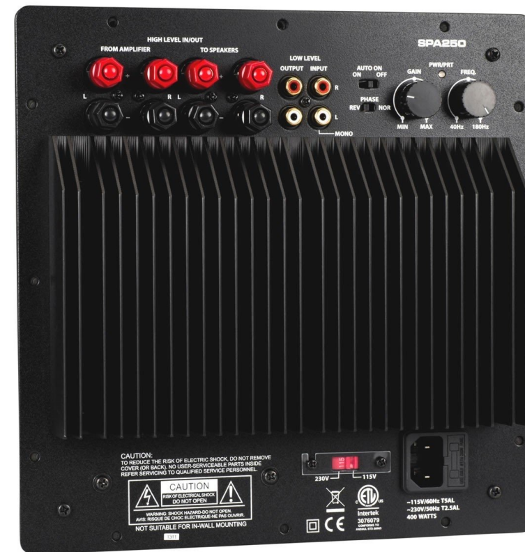
Sub Amplifier ₺1,200,000