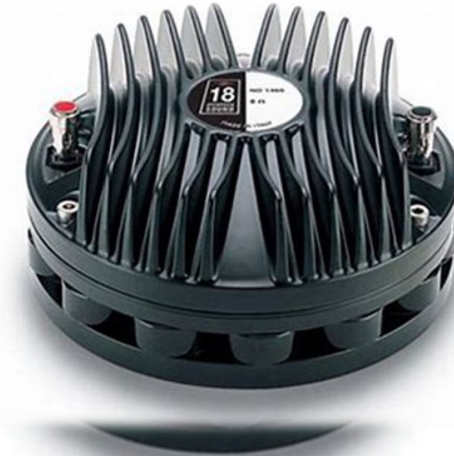
8 units of High Frequency Drivers @ #150,000 each