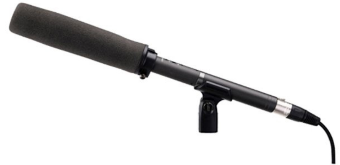
Hyper Cardioid Microphone @ ₺750,000 each Total: ₺2,250,495