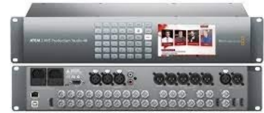
Atem 2 M/E Production Studio 4K @ ₺1,660,195