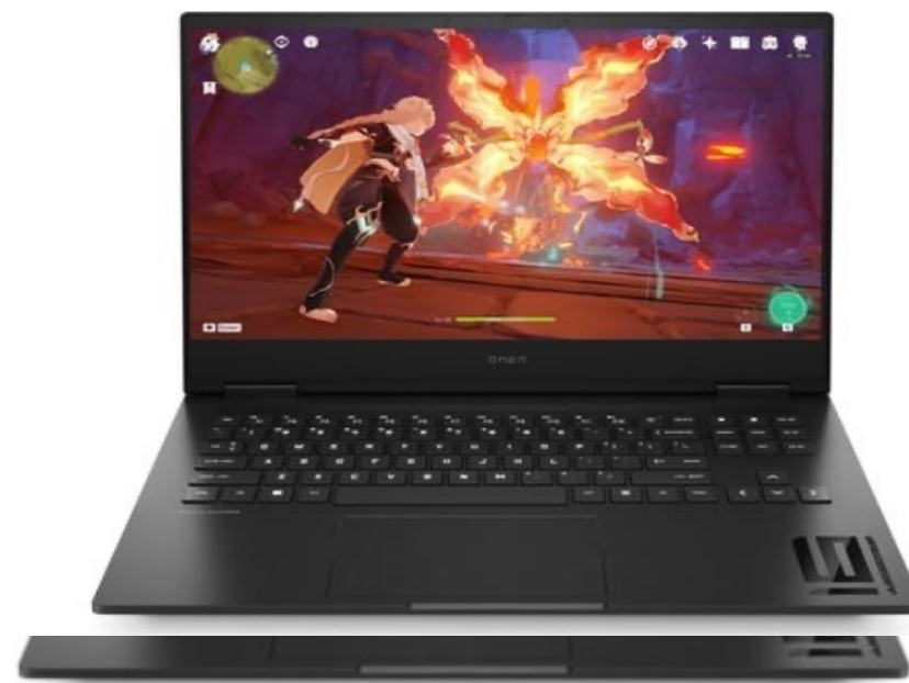
2 HP OMEN 16-K0033 (1 TB, 16GB) @ ₺2,000,000 each Total: ₺4,000,000