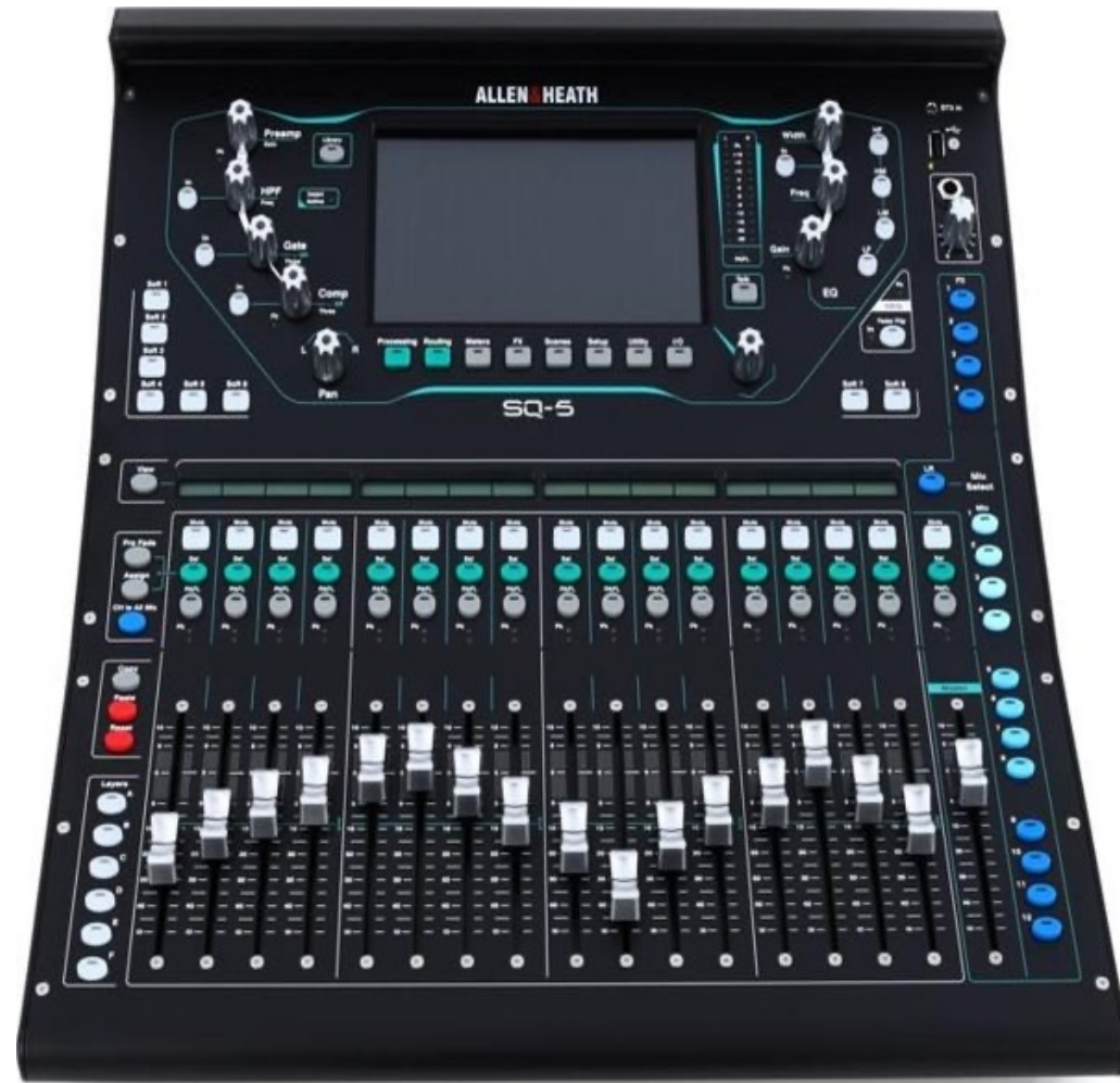
48 Channel Digital Mixer @ ₺4,500,000