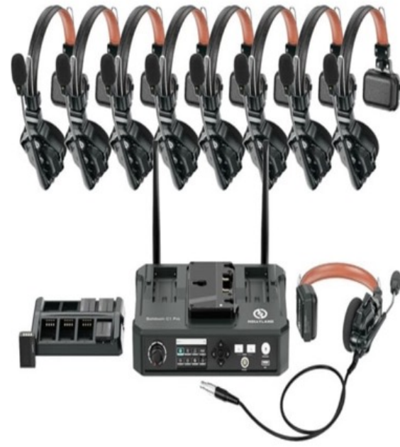
Communication Kit @ ₦3,800,000