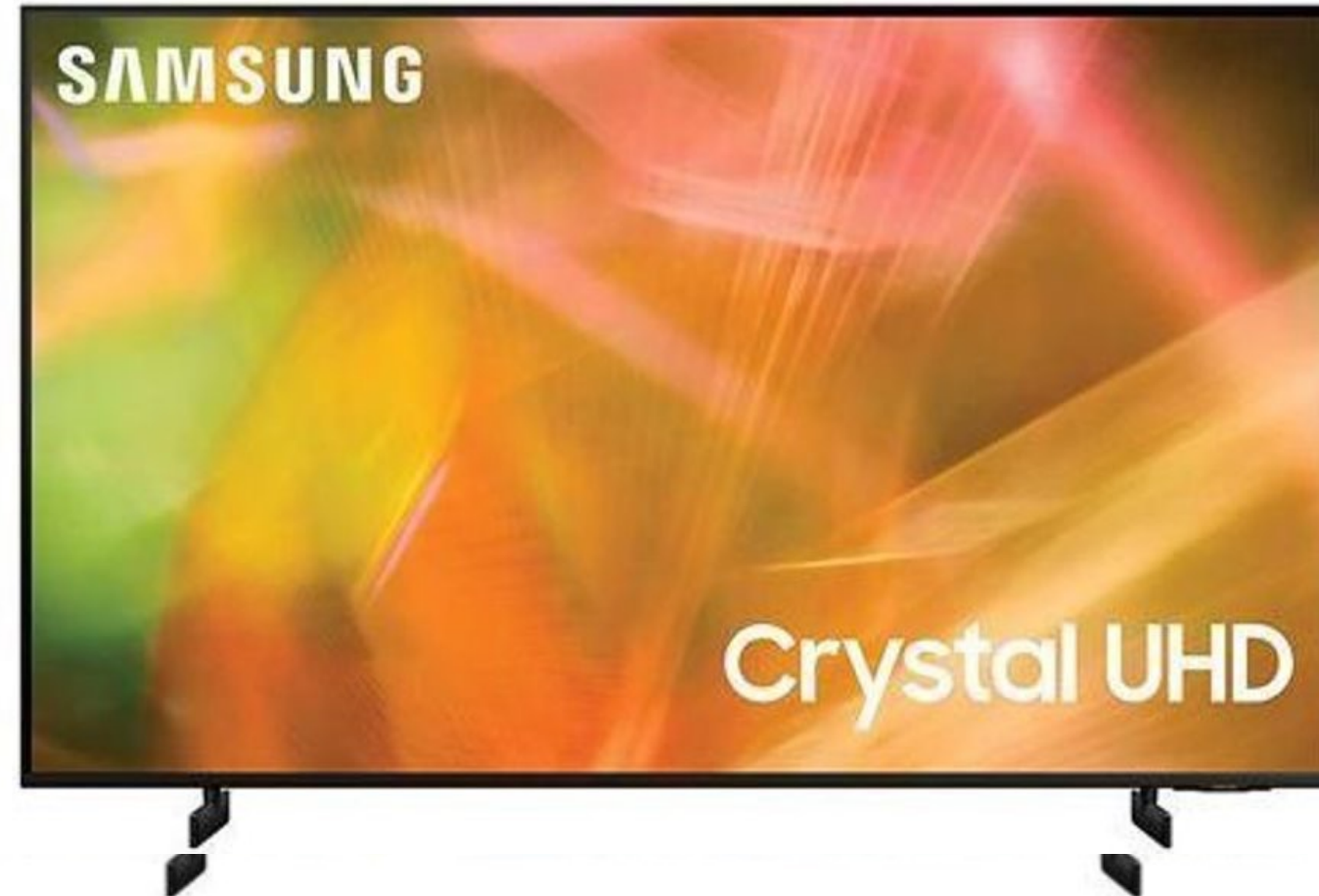
Samsung 55' 4K tv @ ₦570,000 each X8 Total ₦ 4,560,000