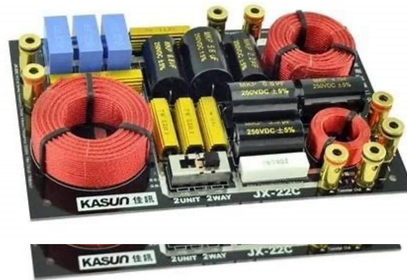
4 units of 110 2ways Speaker Crossover @ #200,000 each Total: #800,000