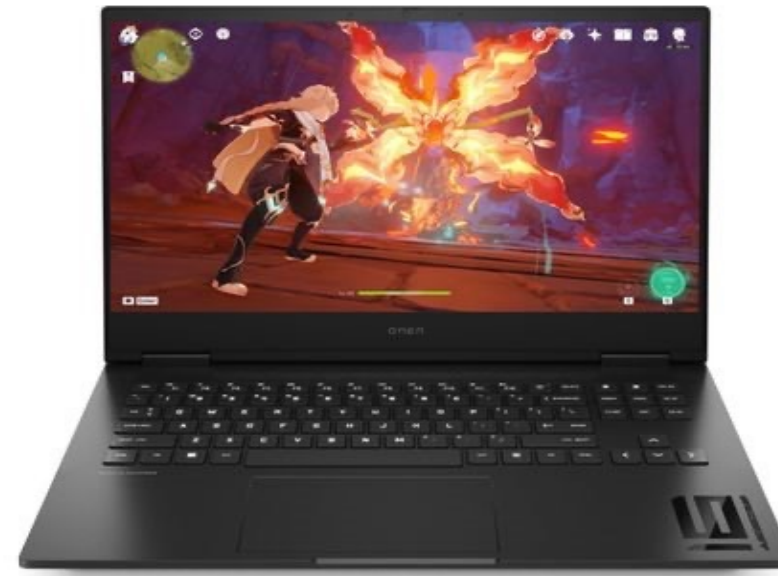
Dell Laptop (1 TB, 16GB) @ ₺600,000