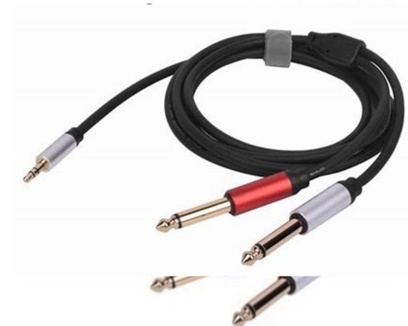
12 units each of Mono Jack, Stereo Jack, and XLR Connectors @ #1,000 each Total: #36,000