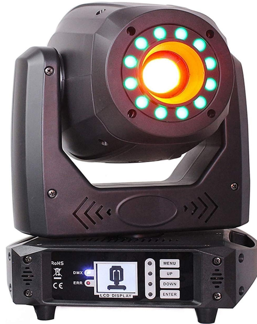
8 Floor Led Stage Light @ ₺400,000 each Total: ₺3,200,000