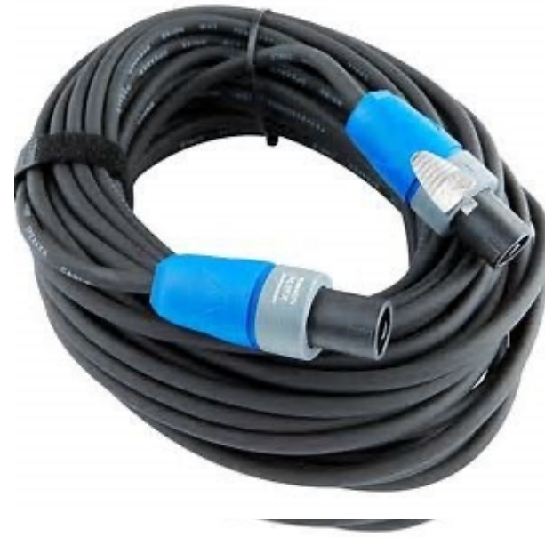
8 Speak-on Speaker Connector @ #2,000 each