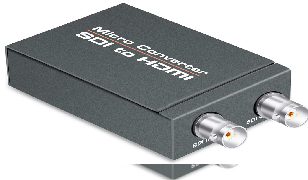
10 SDI- HDMI Converter @ ₦ 75,000 each Total ₦750,000