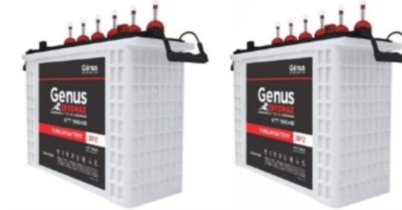
Battery and inverter setup @ ₦5,800,000