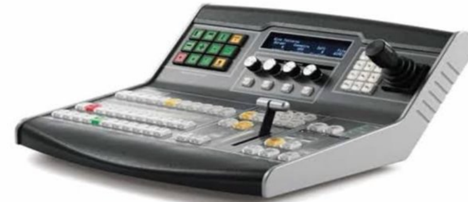
Repair of Current Black Magic hyper Deck Studio @ ₦ 2,000,000