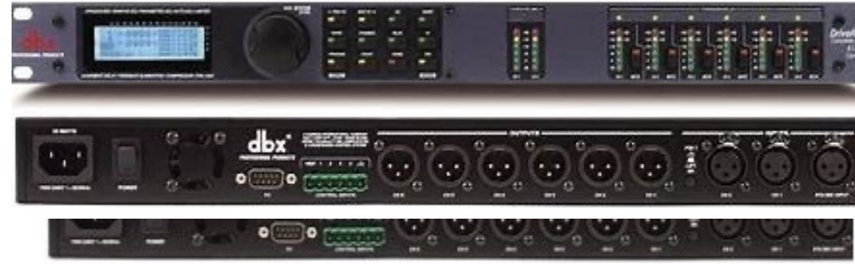
Speakers Management System @ #600,000